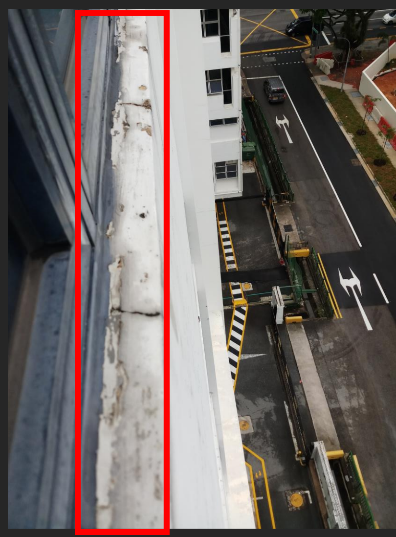
EXISTING SEEPAGE CONDITION